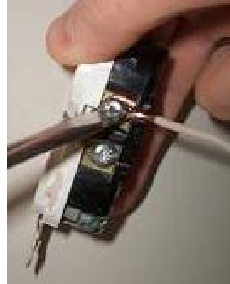
Silver set screws for the white wire