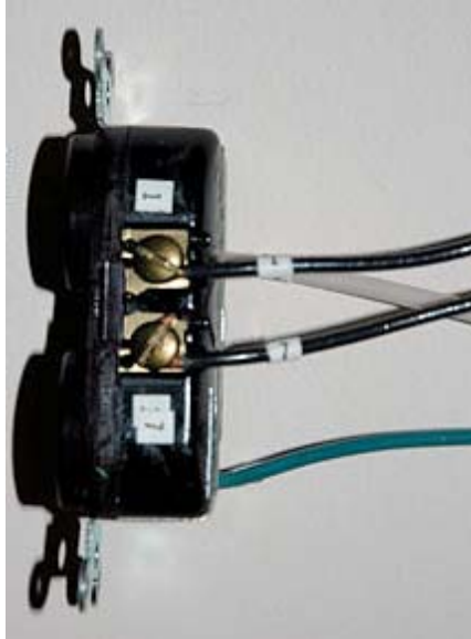
Gold set screws for the hot or black wire